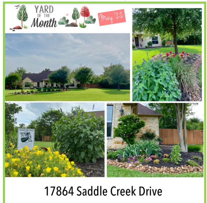
17864 Saddle Creek Drive